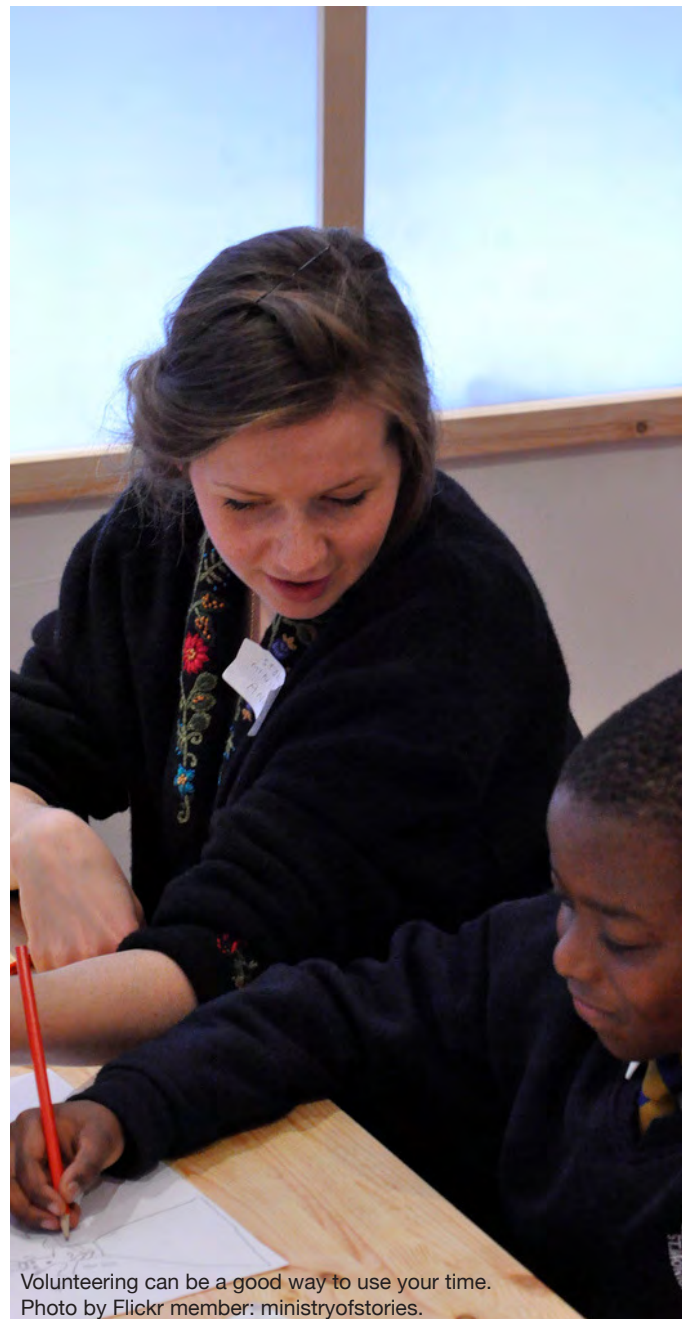
Volunteering can be a good way to use your time.

If you ever wish that you could just get away from it all, prayer and meditation are just around the corner. Prayer and meditation give you the ability to stop, listen, and spend a few moments in silence. It gives you a way to find inner peace and tranquility amidst chaos and disappointment. So if you’ve never prayed or meditated before, now is a good time to start. If you are already doing it, now is your opportunity to spend more time with yourself.