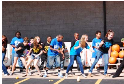
Food Day Flash Mob Organized by the NCCC's Partners in Health and Wholeness Program.