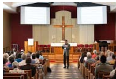
NCCC's 2013 Legislative Seminar.